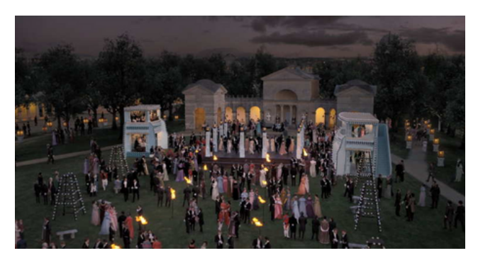
The Vauxhall Pleasure Gardens party was filmed in the Temple of Venus in the National Trust owned Stowe House Landscape Gardens.