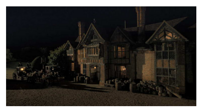
On the way to Clyvedon Castle, the couple stay at a coaching inn, which was filmed at Dorney Court, a 600-year-old Tudor manor.