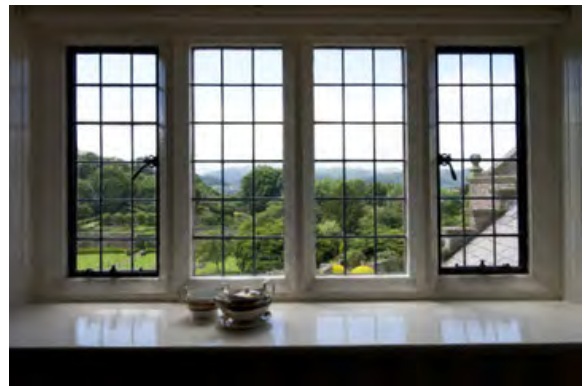
View across the gardens to Conwy Castle and Snowdonia mountain range

The hotel has the relaxed ambiance of a well-kept, well-furnished private manor house rather than a 31 bedroom hotel. With eleven rooms and four principal suites in the Hall, and sixteen cottage suites nestling in the gardens near the Hall and the Spa, all are individually furnished in a traditional country house style with antiques and fine prints, and have all the modern comforts you would expect to find in a world class hotel.